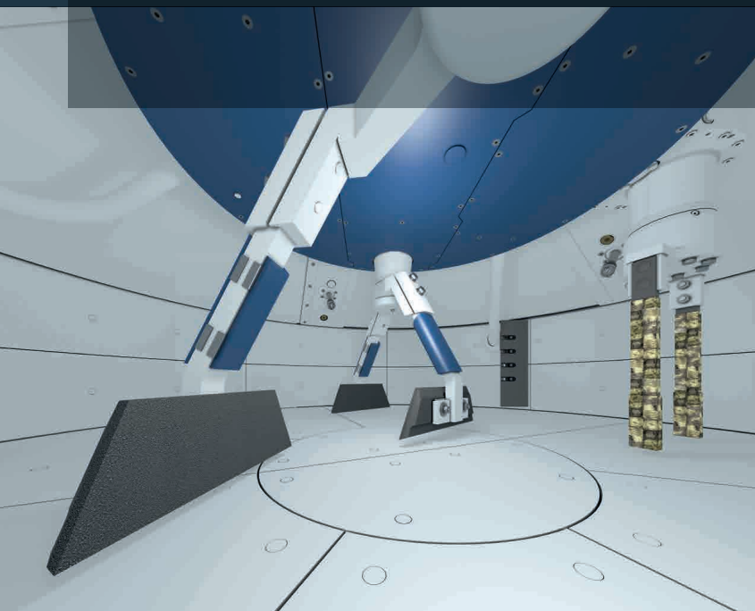
PMP 3000 interior