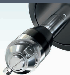
High pressure wash-out system