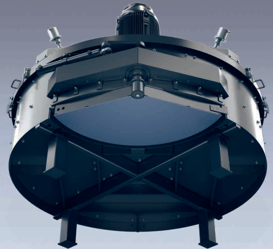
Discharge PMP 3000

The PMP Planetary mixer is an uncomplicated and sturdy mixer that is setting standards with its reliability and durability. Its compact method of construction, the service free layout of all the components and its high quality equipment make it a trustworthy mixer for rough daily operations.