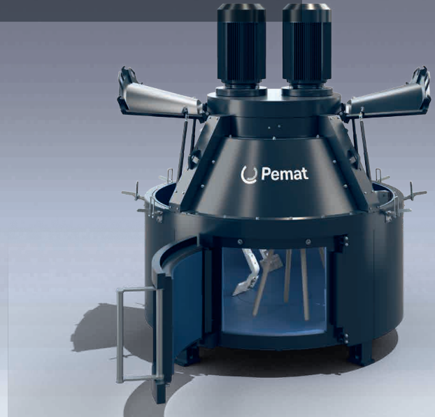
PMPM 500 with open segments

Recipes, aggregates, admixtures and colour are increasingly innovative and specialised. To get the best possible results they need to be mixed perfectly. This places the highest possible demands on a mixer which the PMPM surpasses in all respects. It sets a completely new standard for the quality of mixing results and reveals to the future for mixing technology.