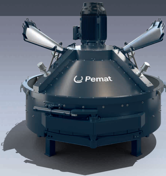
PMP 3000 with open segments