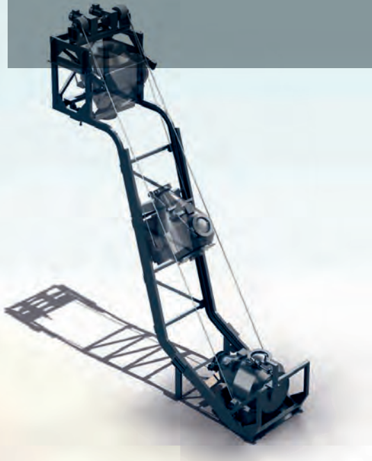
The PAKS in action