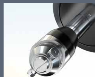
High pressure wash-out system