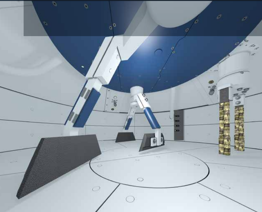
PMP 3000 interior