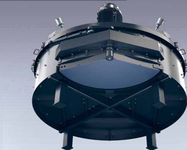
Discharge PMP 3000

The PMP Planetary mixer is an uncomplicated and sturdy mixer that is setting standards with its reliability and durability. Its compact method of construction, the service free layout of all the components and its high quality equipment make it a trustworthy mixer for rough daily operations.