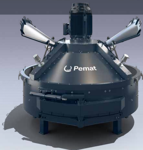
PMP 3000 with open segments