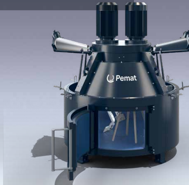
PMPM 500 with open segments

Recipes, aggregates, admixtures and colour are increasingly innovative and specialised. To get the best possible results they need to be mixed perfectly. This places the highest possible demands on a mixer which the PMPM surpasses in all respects. It sets a completely new standard for the quality of mixing results and reveals to the future for mixing technology.