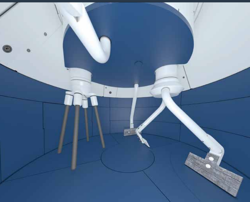
Independently controlled whirler